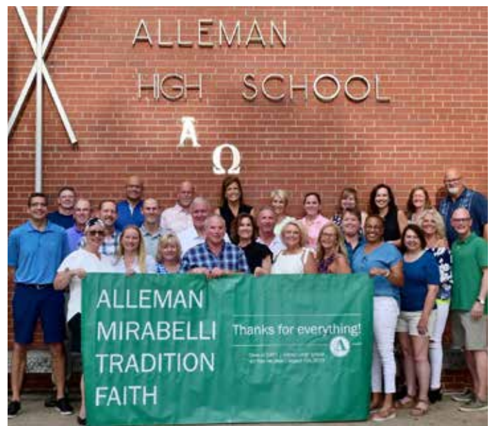
The Class of 1983 celebrated their reunion with a return to the halls of Alleman this past August!