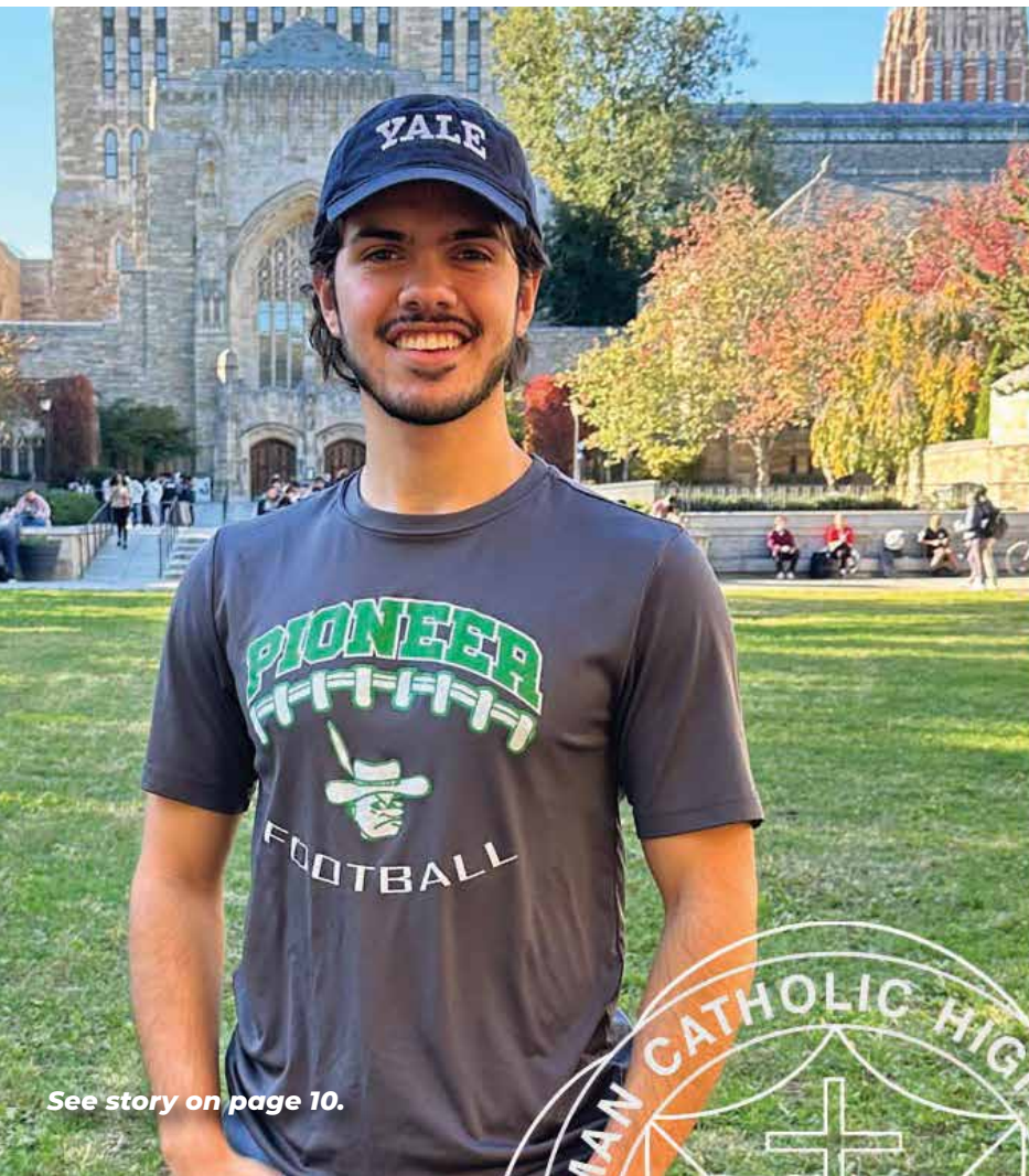
See story on page 10.

“ The greatest strength of Alleman is that it is the perfect size for students to get involved in multiple clubs and explore their passions through multiple avenues. I’ve found this to be crucial to my preparation for college since meaningful involvement on campus is a huge part of what my university expects from its students. ”